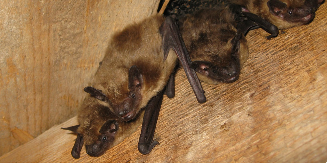
Serotine Bat ( Eptesicus serotinus )