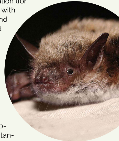
Pond Bat ( Myotis dasycneme )

All relevant details about the discovery (date, location, circumstances, etc.) should be carefully noted and provided to a research centre or laboratory (see Resolution 5.2 for the standard form for submission of bats for rabies testing). Quick and accurate reporting is essential to facilitate proper analysis and monitoring of potential rabies cases in bats, contributing to public health and the conservation of these important creatures.