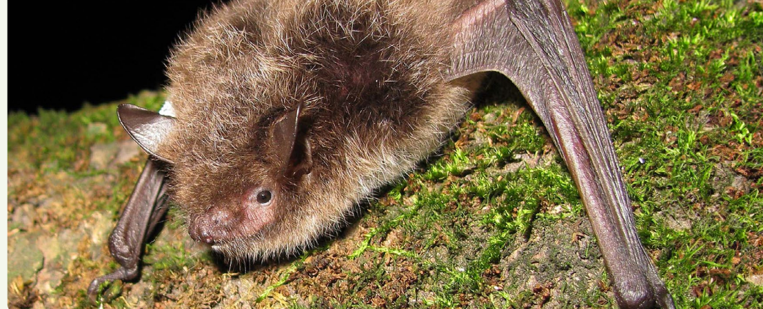
Daubenton's Bat ( Myotis daubentonii )

All bat species in Europe are protected by international legislation and treaties (Habitats Directive, EUROBATS Agreement, Convention on Migratory Species, Bern Convention) as well as by national legislation.