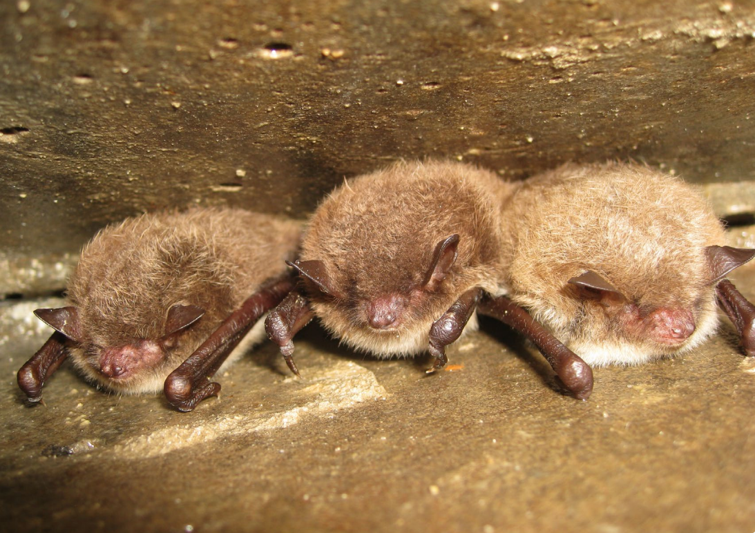
Daubenton's Bat ( Myotis daubentonii )