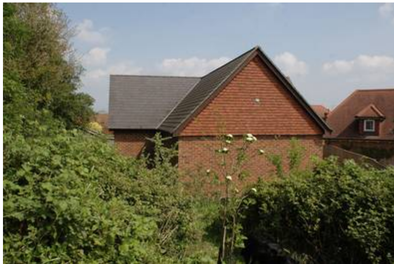
New roost on the edge of a housing development

There were a number of examples gathered from the UK and were usually a product of mitigation for the destruction of existing roosts during housing development. Similar structures to the hibernaculum in Ireland have been successfully constructed for R. hipposideros , P. auritus and Myotis spp. In addition to hibernacula, summer roosts have also been built. One of the earlier examples of this was at the site of an old hospital where a colony of R. hipposideros was roosting in a heated cellar. The building was due for demolition to make way for a new housing estate and a replacement roost was built for the bats. As with the sites in France and Ireland, this consisted of a maternity roost and below ground hibernaculum.