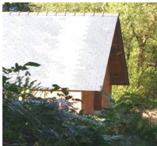
Photograph of the building