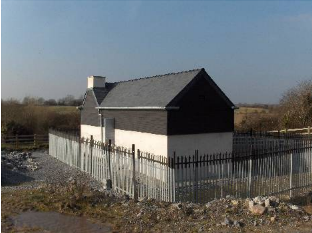
The new roost shortly after construction

Take up at the site has been slow; it took three years before bats were found to be using the building. To date only two bats have been recorded in the hibernaculum and one in the maternity roost.