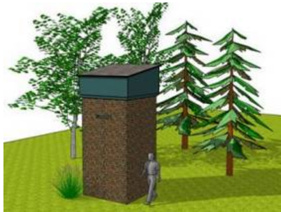
Artist's impression of the bat tower

In the Netherlands a number of bat towers have been constructed. These are aimed at attracting Plecotus and Myotis species.