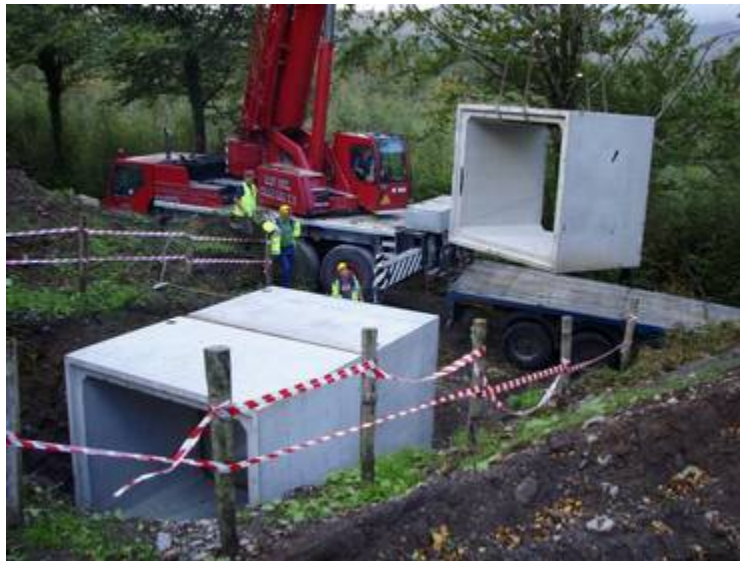
Pre-cast culvert being loaded onto the site

Four roosts, all for R. hipposideros , were reported from Ireland. These included a purpose-built hibernaculum constructed of pre-cast concrete culvert pipes.