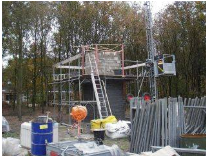
The bat tower during construction