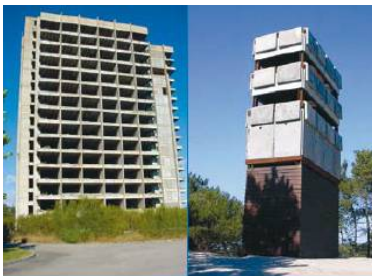
The original roost (left) and its replacement (right)

In Portugal a new roost has been successfully constructed following the demolition of a building used by Tadarida teniotis , Eptesicus serotinus and P. pygmaeus . The developer, in consultation with the Statutory Nature Protection Organisation, built a new roost 150m from the site of the original. Although it was smaller than the original roost it was designed to replicate its thermal characteristics. The new building has been used by all three species, although fewer in number than were found in the original site.