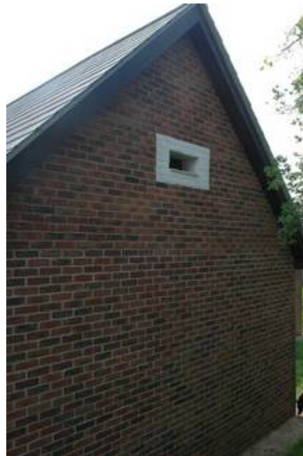
Entrance point for the bats on a shaded gable wall

This site is now used by a colony of some 180 bats