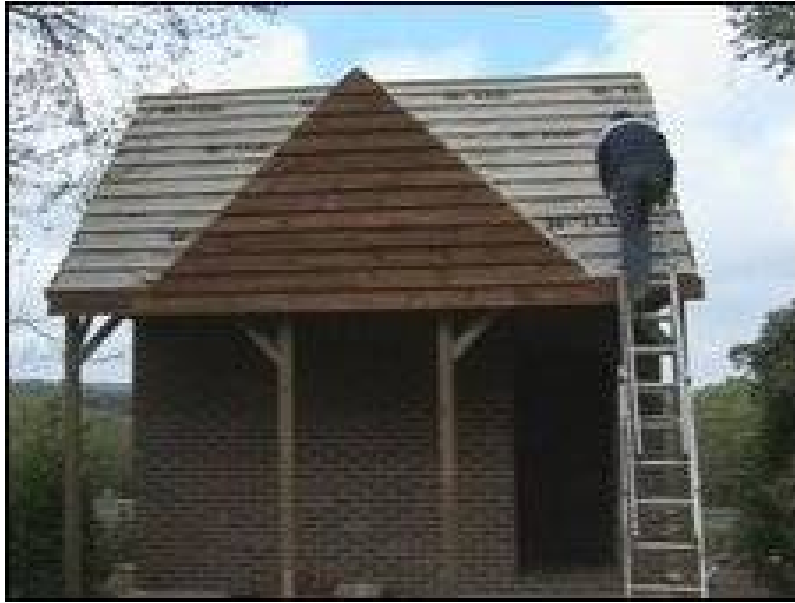
New P. auritus roost