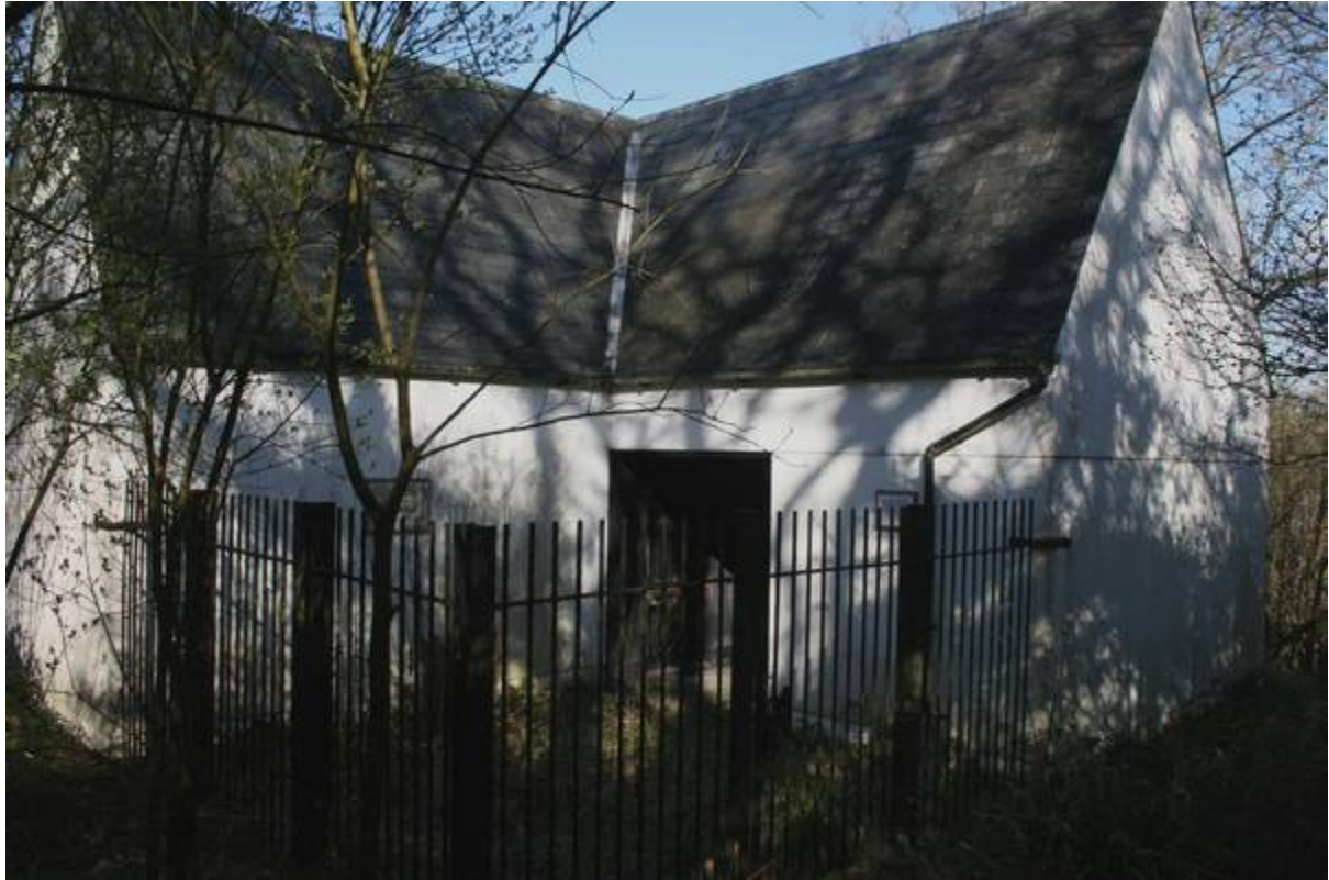
The L-shaped layout was designed to maximise solar gain

During the construction of a new road in southern England a nearby deserted cottage was vandalised and the roof slates were stolen. A colony of 12 R. hipposideros was found roosting in the chimney stack of the building but by this stage the structure had deteriorated so much it had to be pulled down. A new roost was built 100m away using an L-shaped ground plan. It was a number of years before the new roost was adopted by bats but it now has a colony of some 60 animals.