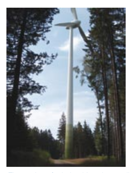
The setting of wind turbines in woodlands is highly dangerous for bats and therefore not recommended by the present guidelines.

Although the timing of the survey is strongly dependent on weather conditions, it should not only provide a good picture of use for foraging and commuting purposes by local bat populations, but should also identify migration of bats. As a consequence it is recommended that a greater intensity of survey work should be undertaken in spring and autumn when bats are migrating. The