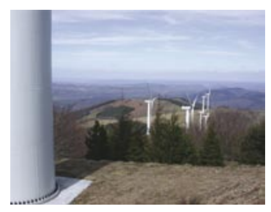
Wind farm built in 2002 (Aveyron, France) on a ridge at the edge of a beech forest. At that time the impact of wind turbines on bats was hardly known and no EIA on bats was done.

analysis, and for providing subsequent advice for avoiding, mitigating or adjusting the impacts. Given the impacts that wind turbines may have on bats, it is re-commended that a pre-survey assessment should be undertaken for all new inland and offshore wind turbine proposals. The pre-survey assessment is a preliminary step to gather evidence of any likely impact on bats that may be present to help the developer in his decision whether a more detailed survey is required.