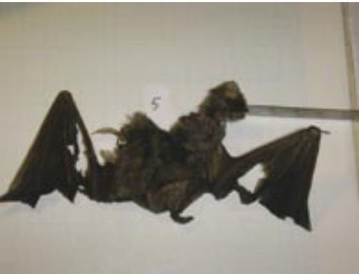
A Schreiber's bent-winged bat (Miniopterus schreibersii) cut in two from the head to the hips by a rotor blade (Camargue wetlands 2006).

Migrating as well as local specimens of different bat species are found throughout Europe as casualties under wind turbines. Noctules (Nyctalus noctula) are the species the most affected by wind turbines in Germany (here wind park Puschwitz in Saxony, Germany).